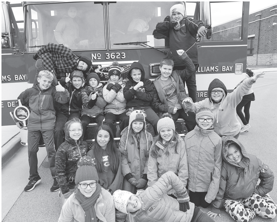
Fifth grade students enjoyed time exploring the fire truck during Fire Prevention Week in October.