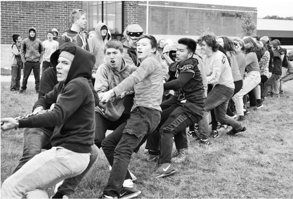
The sophomores give it their all during the lunch time Tug-of-war competition during Homecoming week.