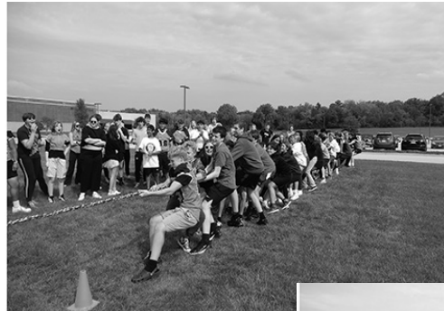
Freshman during their very first tug-of-war