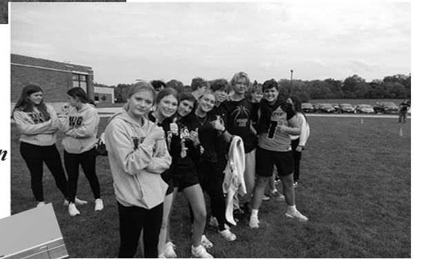
Group of sophomores cheering on their class