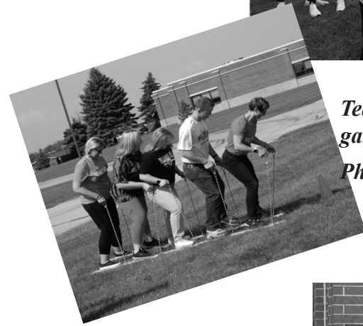
Teachers attempting a new ski race game!