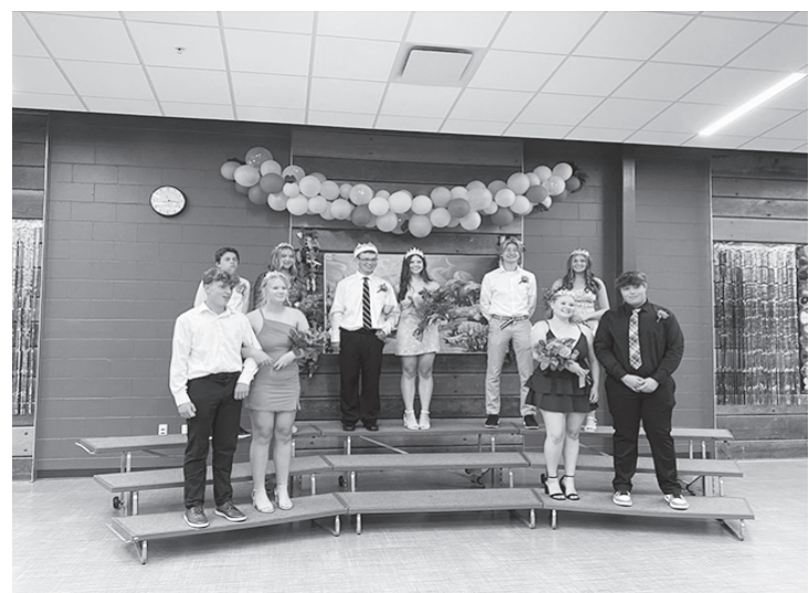
2023 Homecoming Court