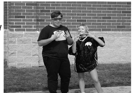
Juniors winning Girls Powderpuff!